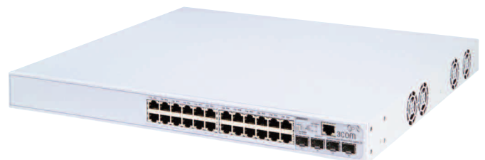
3Com Unified Gigabit Switch

Voice traffic from 3Com and other IP telephony systems can be automatically assigned to a voice-dedicated VLAN, helping to optimize this delay-sensitive traffic. Support for Wi-Fi® Multimedia (WMM®) assures quality of service for wireless VoIP traffic.