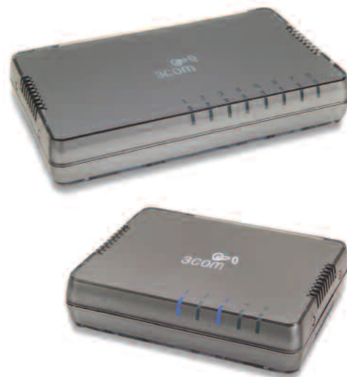
from top: 3Com Gigabit Switch 8, Gigabit Switch 5

Compact, streamlined and affordable highspeed switching with autosensing and auto MDI/MDIX for easy operation