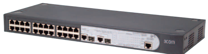
3Com Baseline Switch 2226 Plus

In addition, the web interface features individual port-traffic monitoring (port mirroring) and a unique, quick-glance switch status review. A cable diagnostic tool lets users troubleshoot basic connectivity problems via the web management interface further simplifying network installation.