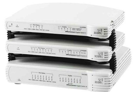
from top: 3Com OfficeConnect Gigabit Switch 5, Switch 8 and Switch 16

Silent operation. Self-cooling fanless design (5- and 8-port models) ensures there is no noise disturbance from the switches.